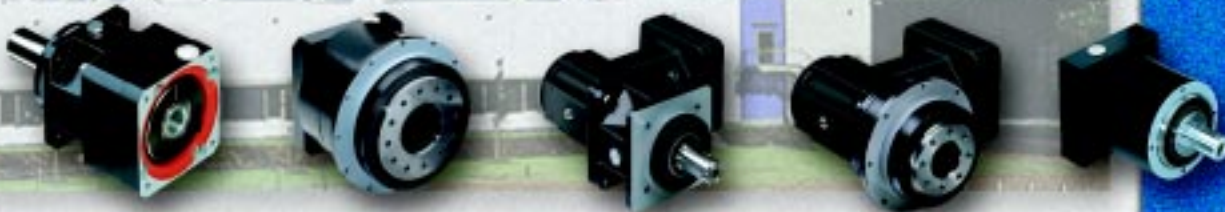
ServoFit™ Precision Planetary Gearheads

STOBER Drives, Inc. 1731 Downing Drive, Maysville KY 41056 Phone: 606 759-5090, FAX: 606 759-5045 Web: www.stober.com, E-mail: sales@stober.com