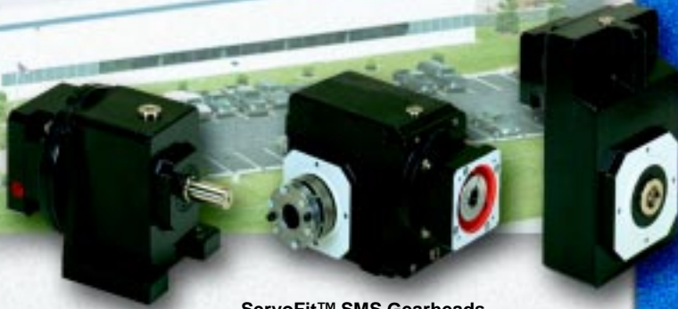
ServoFit™ SMS Gearheads