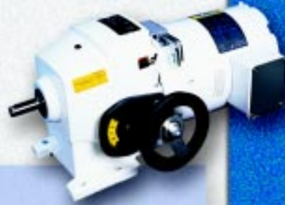
STÖBER Antriebstechnik Pforzheim, Germany